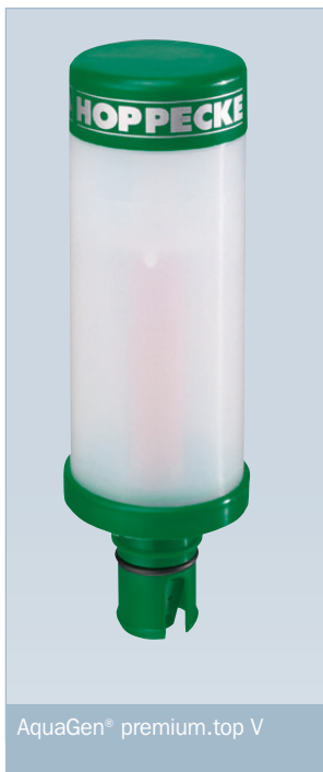
AquaGen® premium.top V

Because of this level of efficiency, water refilling is drastically reduced to a level where total freedom from maintenance is possible.