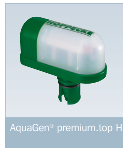
AquaGen® premium.top H

The AquaGen® premium.top H version is available for capacities up to 340 Ah and for applications with restrictions due to dimensions (e.g. height with reference to battery assembly, and depth with reference to cell size).